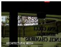
Chambers of Gold - Film I: Anna's Room