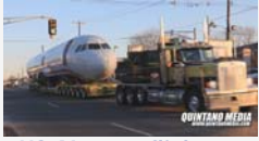
US Airways flight 1549 Being Transported to Harrison NJ