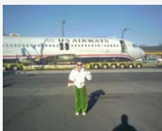
Hey, that's me and the Miracle Plane!